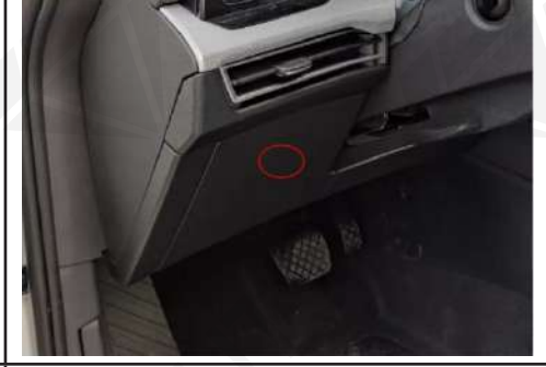
19. Punch a hole by 16mm drill to install our universal front switch.