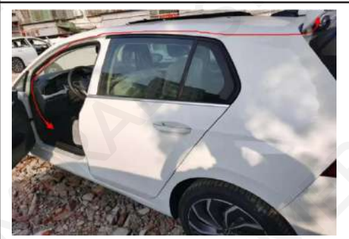
11. Route the power cable CAN cable along the red line to the fuse box.