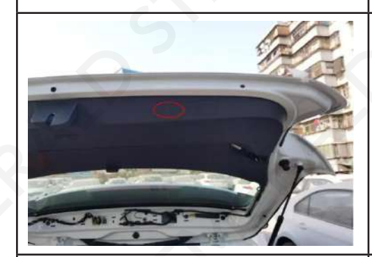
20. Punch a hole by 16mm drill to install our universal rear switch.

After then installation is completed, you must set the tailgate learning. Make sure that the door can be opened and closed in place. (Raise the tailgate to ideal height. Then press the tailgate button for 3-5 seconds. You will hear a sound "Deep — —" and then loose your hand. Press the tailgate button again and close it. You will hear a sound again "Deep". Tail gate learning is finished.