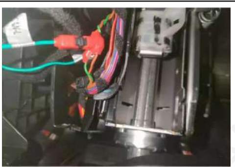
15-2. Our CAN-H cable is connected to the green cable and the CAN-L cable is connected to the orange-grey cable.