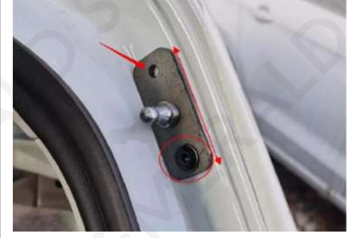
4. Replace the brackets with ours and fix its one side to make sure the position of the other side. Punch a hole by 8mm drill to fix our brackets with screws.