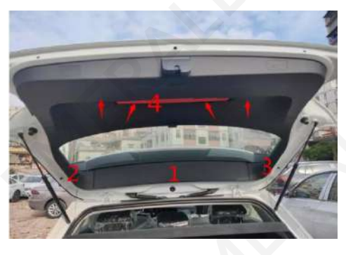
2. Follow the steps to remove the trim panel of tailgate.