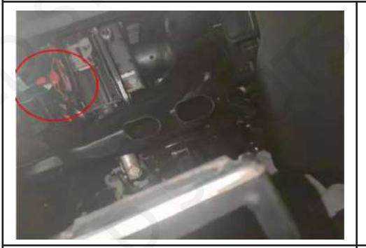
15-1. The CAN cable of low configuration car is connected under the steering wheel.