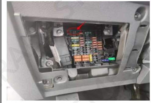
12. Find out the fuse box.