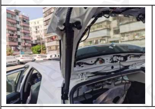
6. Install the struts and the circlip of the ball cap must be locked in place, otherwise it will come off the rod.