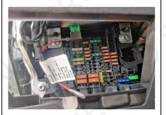
13. Insert our electrical appliance.