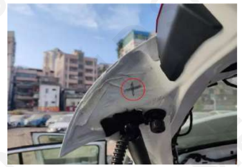
7. Punch a hole by 22mm drill to route the strut cables and install the silicone stoppers.