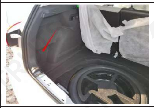
18. Fix the latch electric suction box on the left side of trunk.