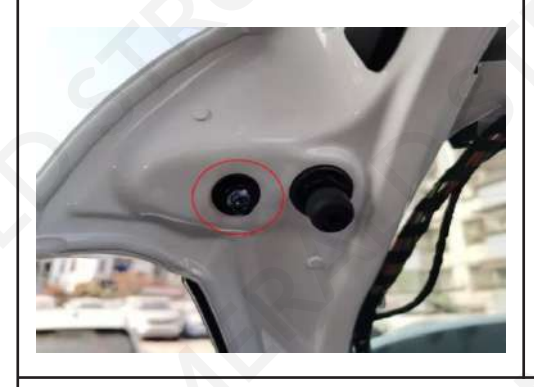
5. Replace the ball nails with ours.