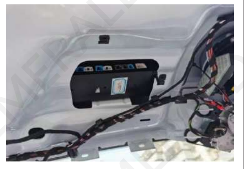
17. Fix the control box and plug in the cable.