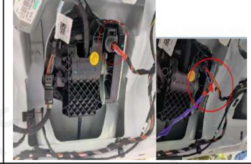
9. The plug of the original lock is connected to our three-way adapter socket and insert the original lock machine on the socket of the product lock machine.