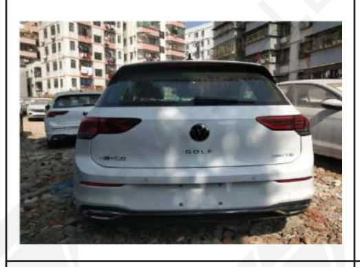
1. The original car's tailgate rendering.