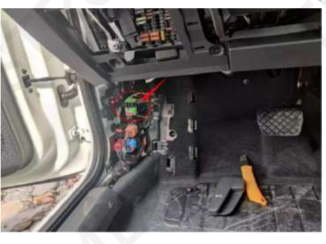
14. Find out the CAN cable.