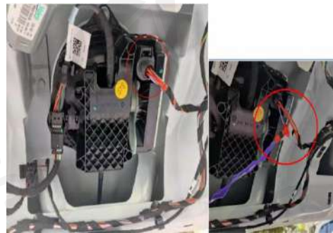
10. The plug of the tailgate's handle is connected to our 3-way adapter socket or the product handle detection cable is connected to the purple cable of the socket.