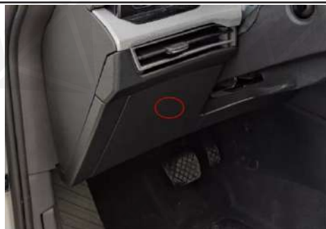
19. Punch a hole by 16mm drill to install our universal front switch.