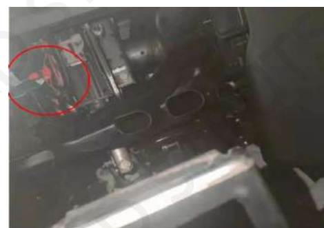
15-1. The CAN cable of low configuration car is connected under the steering wheel.