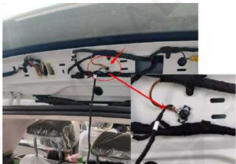
16. Connect to our ground cable.