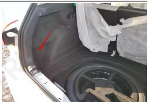
18. Fix the latch electric suction box on the left side of trunk.