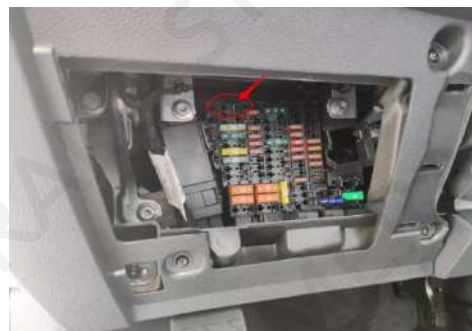
12. Find out the fuse box.