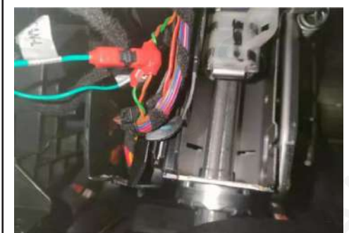
15-2. Our CAN-H cable is connected to the green cable and the CAN-L cable is connected to the orange-grey cable.