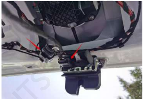
9. The plug of the original lock is connected to our three-way adapter socket and insert the original lock machine on the socket of the product lock machine.