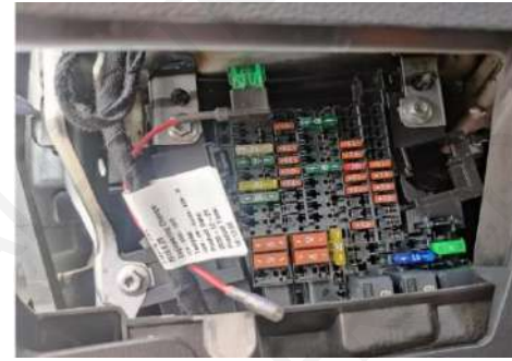
13. Insert our electrical appliance.