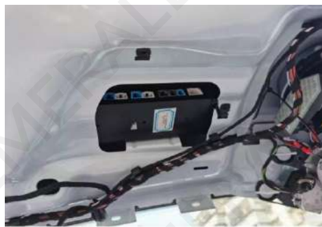
17. Fix the control box and plug in the cable.