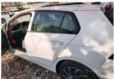
11. Route the power cable CAN cable along the red line to the fuse box.