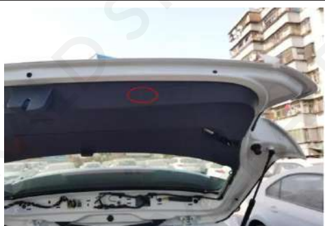
20. Punch a hole by 16mm drill to install our universal rear switch.

After then installation is completed, you must set the tailgate learning. Make sure that the door can be opened and closed in place. (Raise the tailgate to ideal height. Then press the tailgate button for 3-5 seconds. You will hear a sound “Deep — —” and then loose your hand. Press the tailgate button again and close it. You will hear a sound again “Deep”. Tail gate learning is finished.