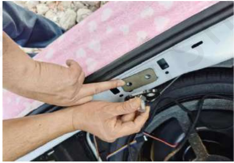
8. Replace the lock with our latch lock.