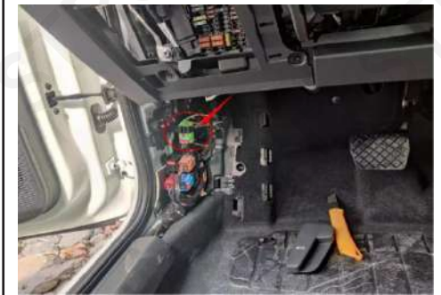
14. Find out the CAN cable.