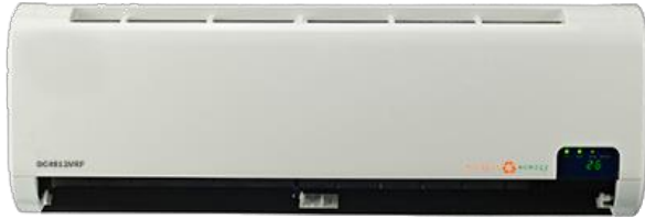
Wall Mount Indoor Unit (IDU)

12,000 BTU 48V DC Heat Pump VRF Dynamic Capacity Compressor 100% DC - No Inverter