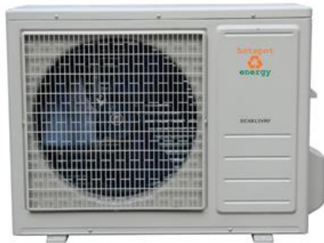
ODU (Outdoor Unit)

Variable Refrigerant Flow & Capacity means that the air conditioner is always the right size for the conditions and is never wasting power.