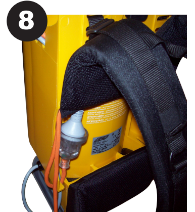
8 Final Product should look like this.