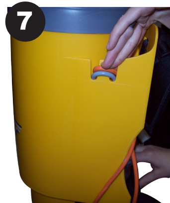
7 Feed Extension Lead through inside left hand side and hook loop around the tooth