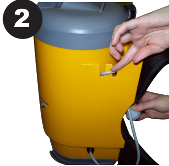
2 Feed Power Cable through the inside left hand side and hook loop around the tooth, ensure plug sits in the middle when hanging