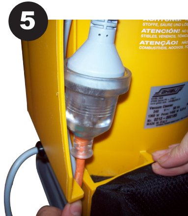
5 Secure Extension Lead Firmly into Groove on Left Hand Side