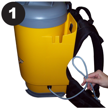
1 Loop Power Cable