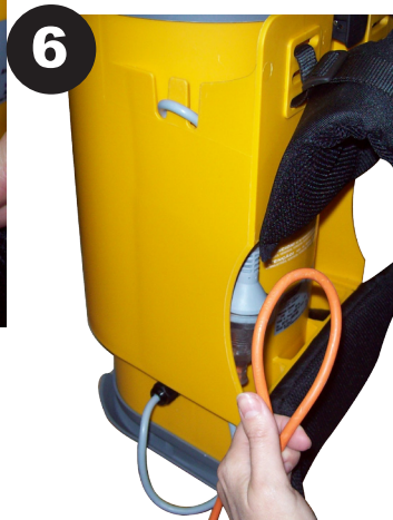
6 Loop Extension Lead