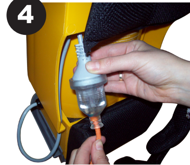
4 Connect Extension Lead to Power Cable