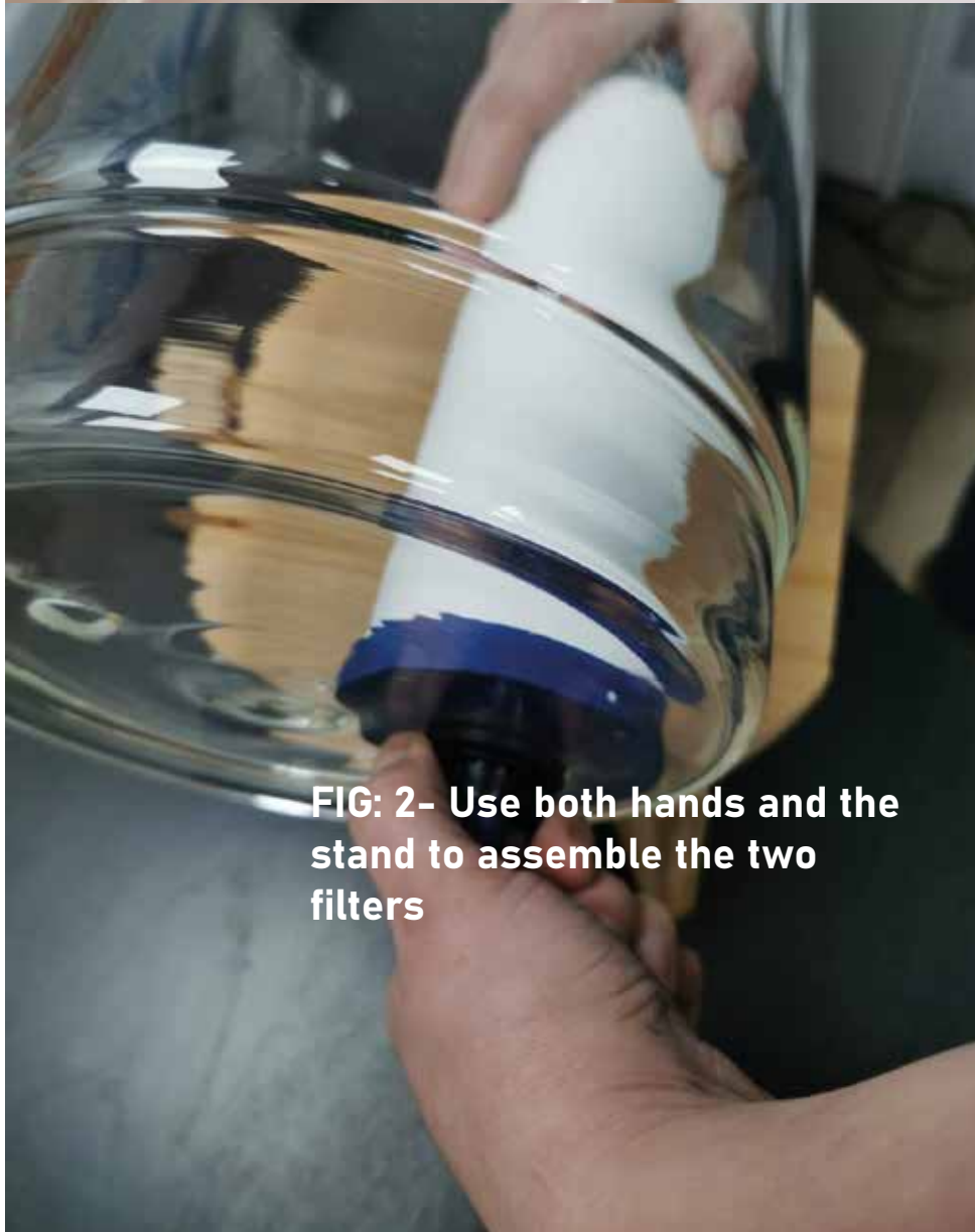
FIG: 2- Use both hands and the stand to assemble the two filters