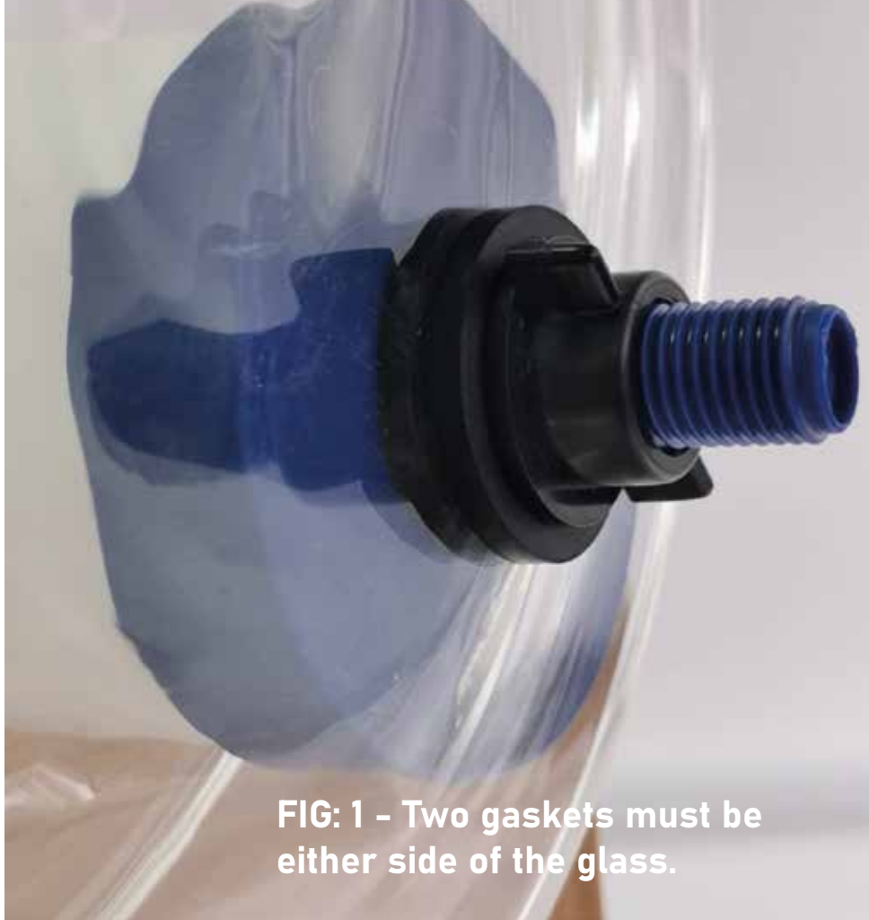
FIG: 1 - Two gaskets must be either side of the glass.