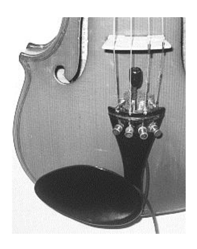
Miking near the bridge gives a bright sound