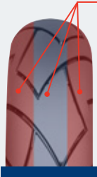
*Multi Compound Tread Technology (MCTT)

The selected rear sizes feature the Multi Compound Tread Technology (MCTT): the central tread provides increased mileage while the shoulder tread ensures superior grip at all lean angles.