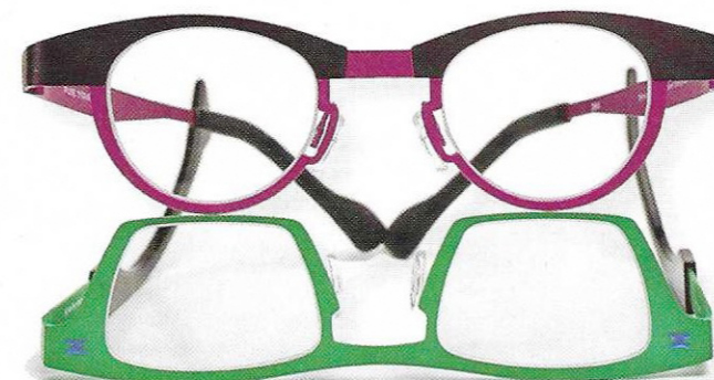
Theo "Buro" and "Fourteen", ceyewear.com