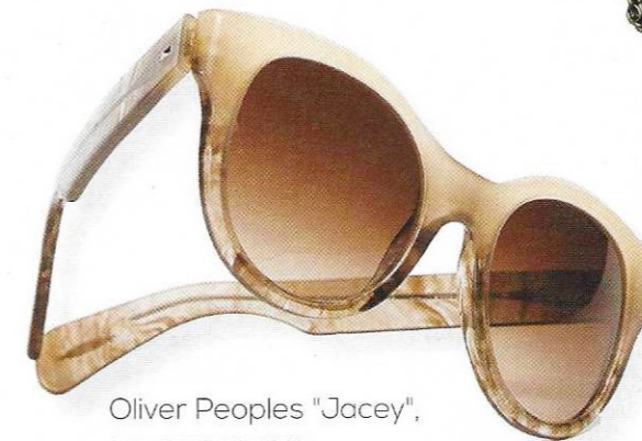
Oliver Peoples "Jacey", ceyewear.com