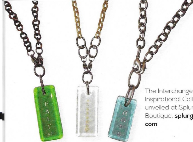
The Interchangeable Inspirational Collection unveiled at Splurges Boutique, splurgesboutique.com