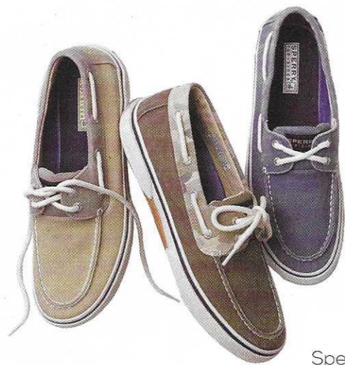
Sperry "Halyard" available at Belk, Belk.com