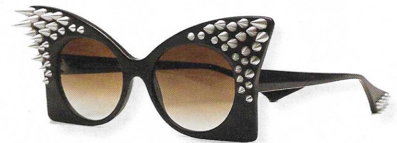
Face a Face "Punk It" Limited Edition, ceyewear.com