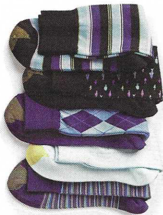
Novelty Socks by Gold Toe available at Belk, Belk.com