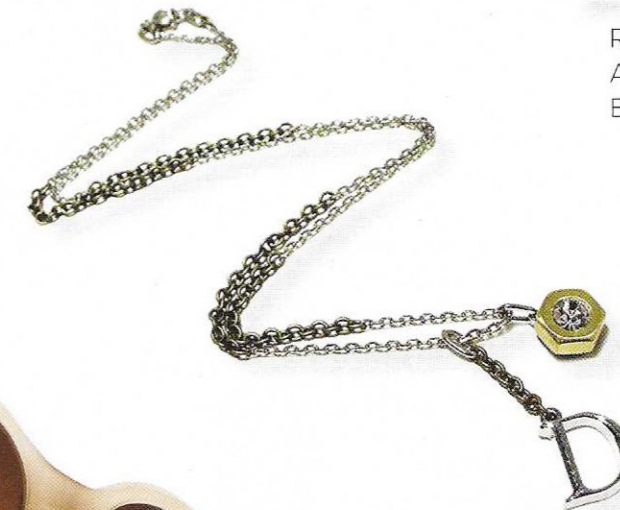
This is another exclusive collection featuring iWEAR ...do you? available only at Splurges Boutique, splurgesboutique.com