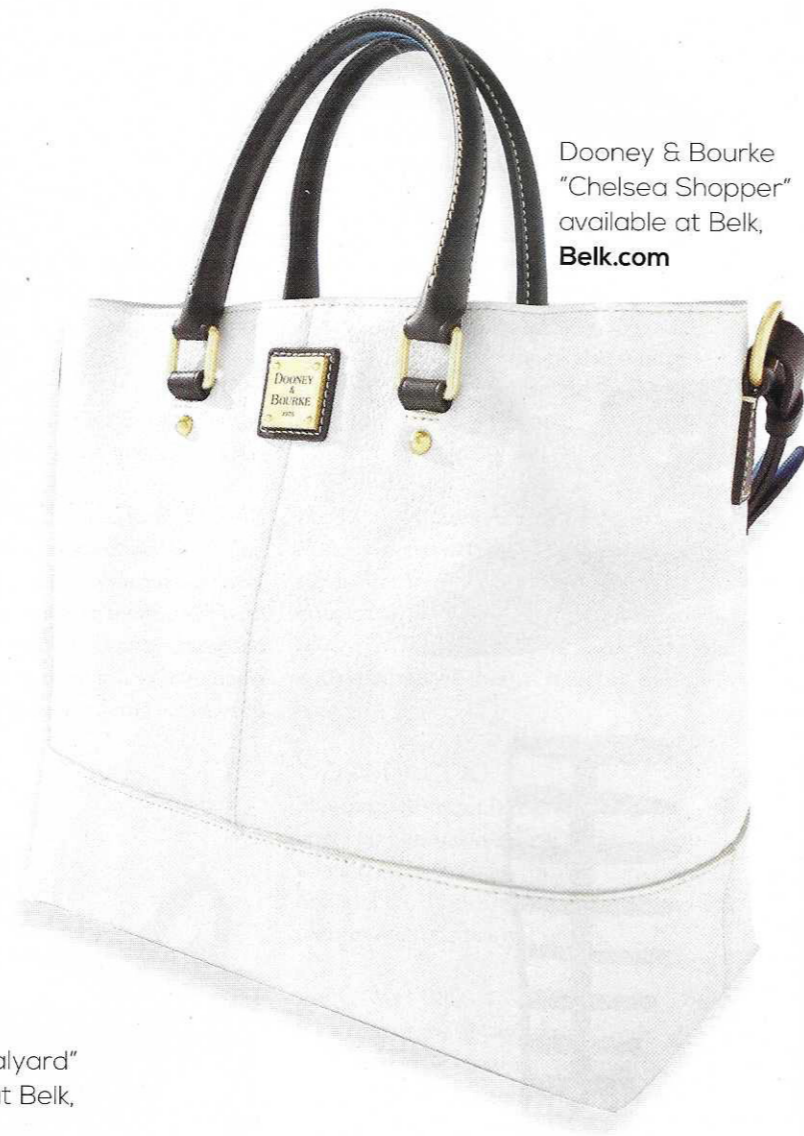
Dooney & Bourke "Chelsea Shopper" available at Belk, Belk.com