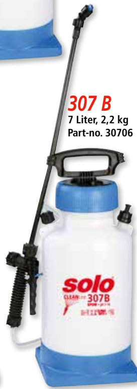
307 B 7 Liter, 2,2 kg Part-no. 30706

The SOLO pressure sprayers with shoulder strap have long been popular and reliable aids for cleaning and disinfecting over larger areas or longer jobs. They do not take up much storage space and are ready for immediate use whenever required. Two tank volumes with 5 or 7 litres are available, depending on the size of surface that should be treated. The intensity of use also plays an important role, of course. The containers are some of the most robust on the market. An accidental tumble or similar tough tests are no problem for these professional pressure sprayers. With resistance to UV rays, the transparent containers are all set for a long service life. The extra-large piston pump, which generates the necessary working pressure with just a few pump strokes, ensures fatigue-free work. The trigger valve is ergonomically shaped and, together with the sturdy fabric re-enforced hose and the 50 cm long lance made of special non-corrosive material, ensures a long reach. The sprayers can be easily opened by turning the handle, which can also be used to clip in the lance after work. The large filling opening facilitates filling as well as emptying and cleaning of the sprayers. The equipment includes a high-quality, chemical-resistant flat spray nozzle and a practical long and wide carrying strap.