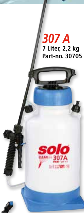
307 A 7 Liter, 2,2 kg Part-no. 30705