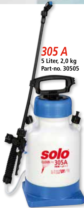
305 A 5 Liter, 2,0 kg Part-no. 30505