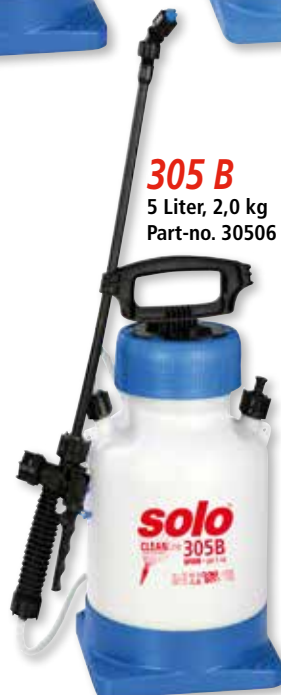
305 B 5 Liter, 2,0 kg Part-no. 30506