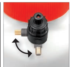
Other accessory: Compressed air valve connection to pressurize tank without pumping manually.