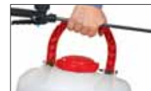
Large, foldable carrying handle with integrated spray wand holders (425/475 Comfort)