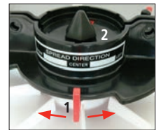
Adjustable direction of throw (1), agitator (2)