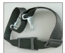
Comfort - carrying strap