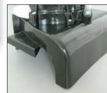
Safe footing and ergonomically shaped