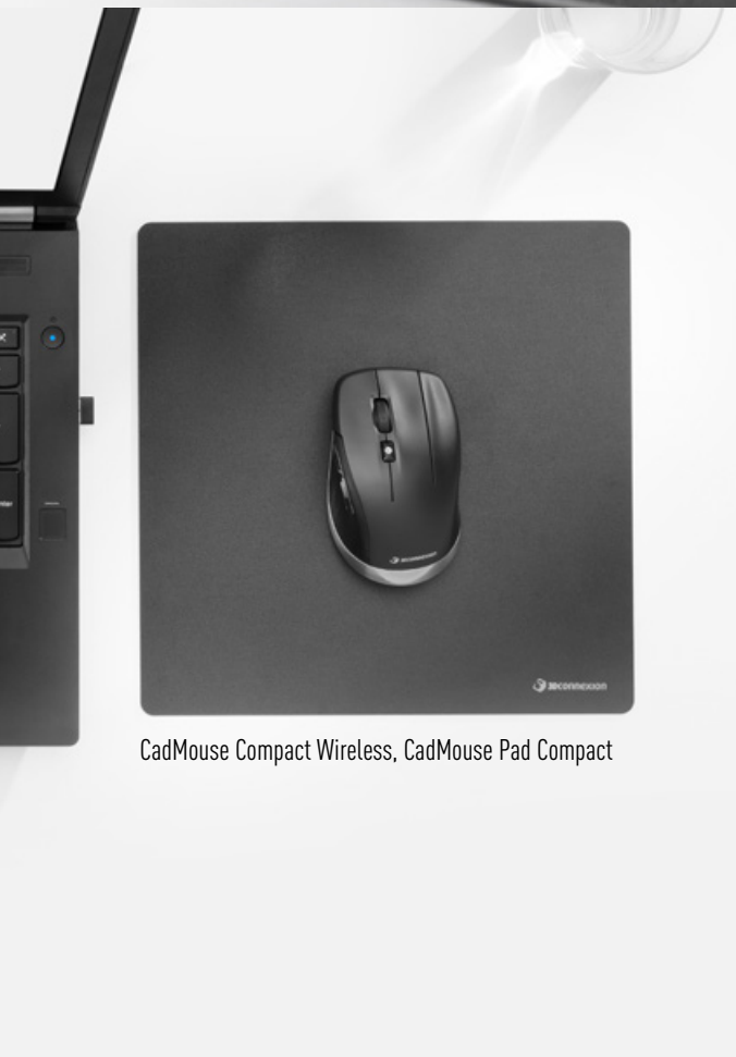
CadMouse Compact Wireless, CadMouse Pad Compact

Dedicated Middle Mouse Button – the days of clicking the mouse wheel are over thanks to the CadMouse's intelligent ergonomic design.