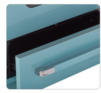
Zinc Cast Handles