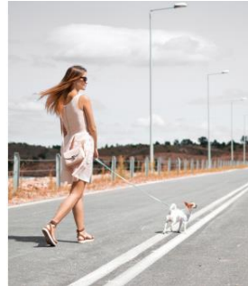
Too far away