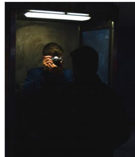
Picture is too dark