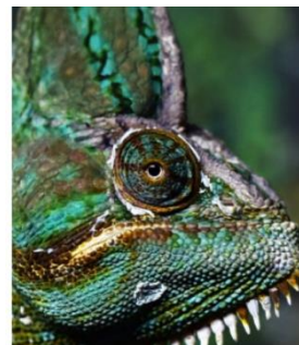
More Detail – Longer painting