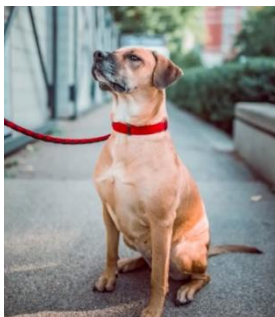
Clear background – Easier to paint