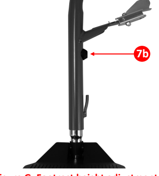
Figure G. Footrest height adjustment

Adjusting the Footplate height (Figure G) Loosen the locking bolt on the stem (7b) with the hex key provided, slide footplate tubing and adjust to a suitable height. Tighten bolts to fix in place.