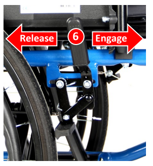
Figure D. Hand Brake