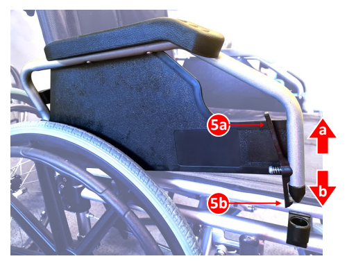
Figure C. Flip Up Armrests