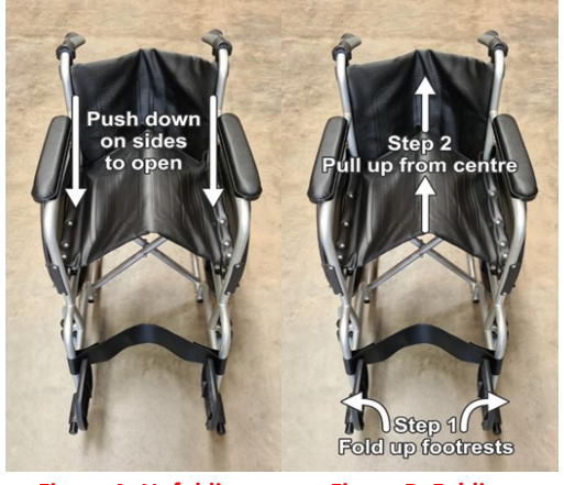
Figure A. Unfolding

Step 1: Turn up both footplates (11). Step 2: Pull up centre of seat (6) from the front and rear and fold closed.