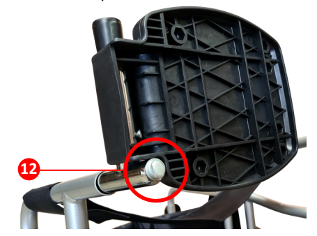
Figure C. Footrest height adjustment

Loosen the locking bolt on the base of the stem (12) with tool provided, slide tubing and adjust the footplate to a suitable height. Tighten bolts to fix in place.