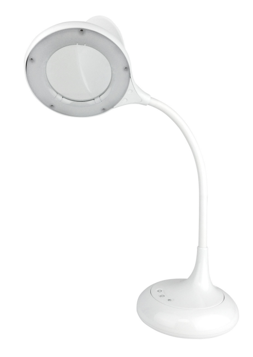
Instruction Manual Model: XL20804

Please read these instructions carefully before connecting or using the appliance. Keep for future reference.