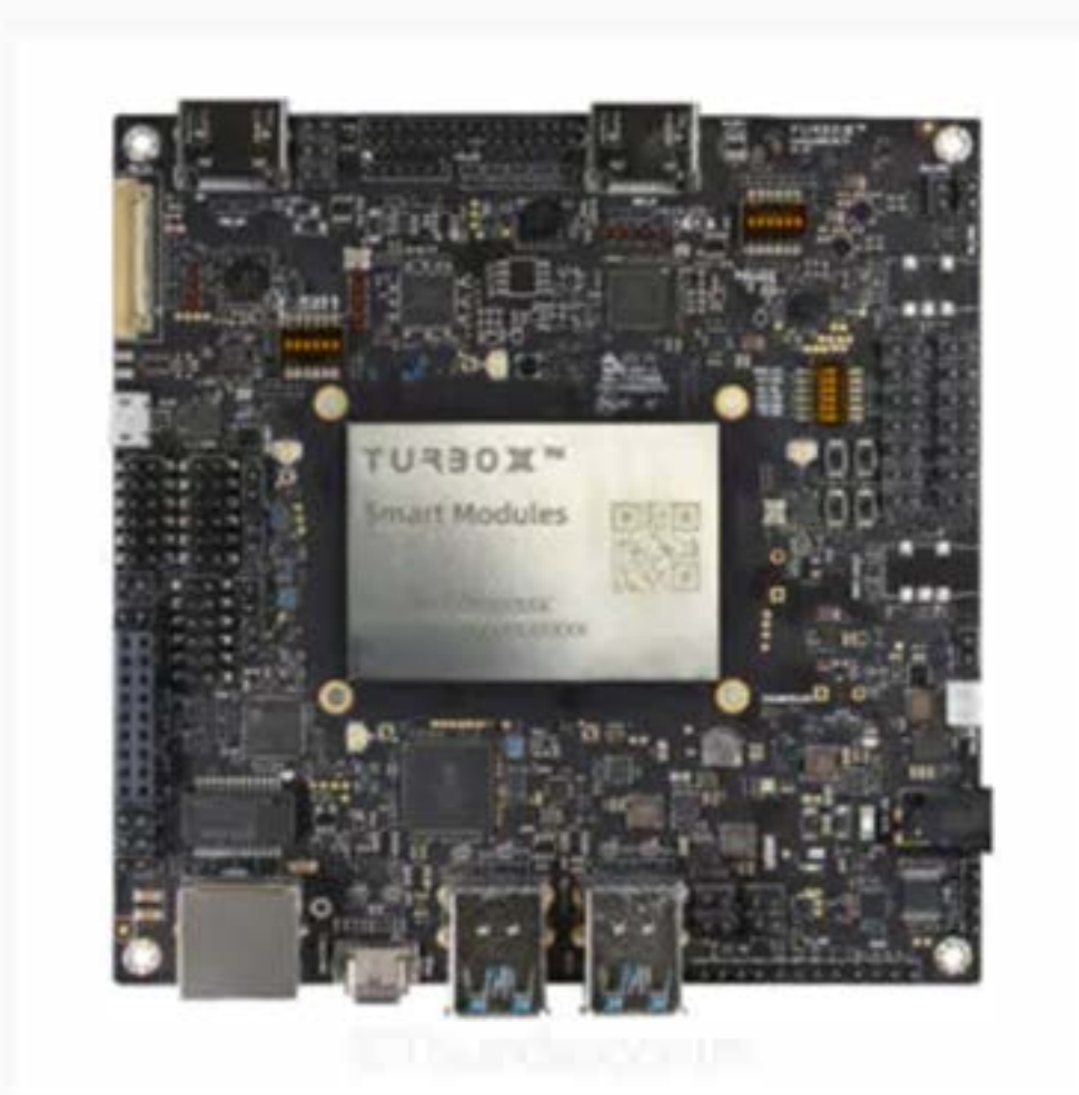
CM450/C450/CM625/C626 Development Kit