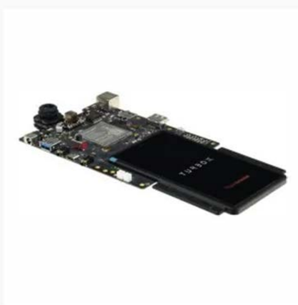
C610/C410 Open Kit