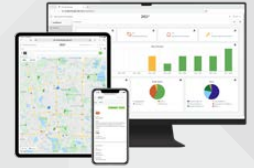
Manage this device with Digi Remote Manager