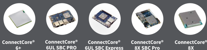
ConnectCore® 6+ ConnectCore® 6UL SBC PRO ConnectCore® 6UL SBC Express ConnectCore® 8X SBC Pro ConnectCore® 8X