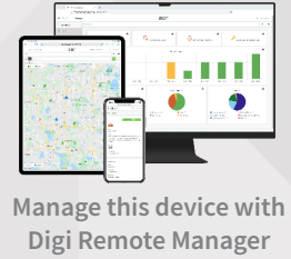
Manage this device with Digi Remote Manager