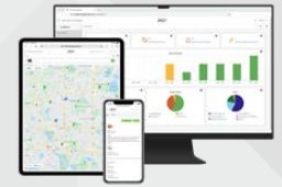
Manage this device with Digi Remote Manager