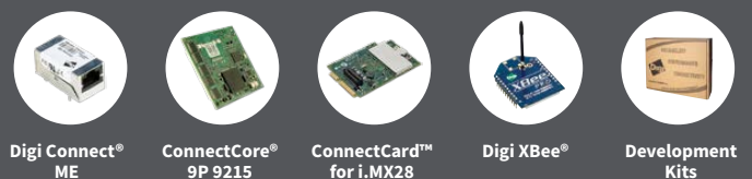
Digi Connect® ME