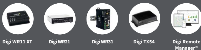
Digi WR11 XT