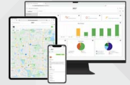
Manage this device with Digi Remote Manager