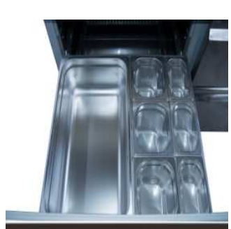
Pans not included