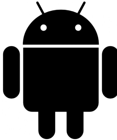
Tablet or Smartphone

"XP" 32 & 64bit "7" 32 & 64bit "VISTA" 32 & 64bit "8" 32 & 64bit, "8.1" 32 & 64bit "10" 32 & 64bit