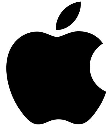
iPad or iPhone