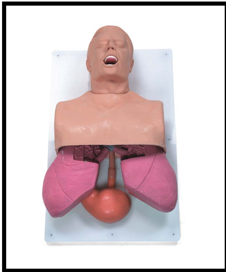
Adult Airway Management Trainer No. 501