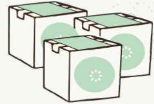
Seeds & Nutrients