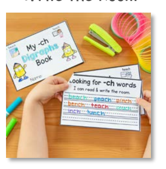
Write The Room