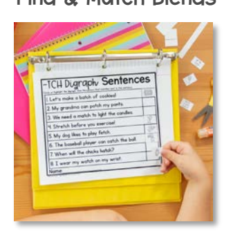
Find & Match Blends