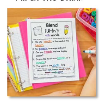
Fill In The Blank