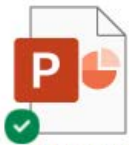
APRIL Poetry Mats INTERACTIVE PPT

Image files for each sheet are included for use with Seesaw or another secure, password-protected platform for your classroom of students.