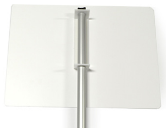
Special mounting bracket on the back of a Header Sign