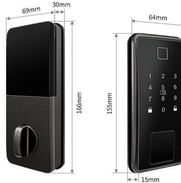
Adjustable Single Latch #60 or #70