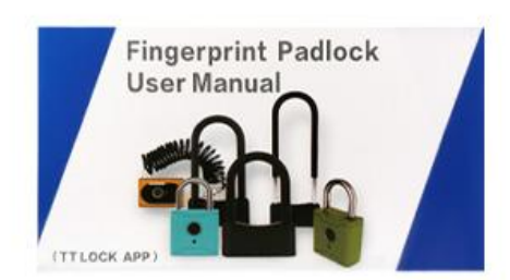
User Manual ×1