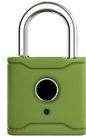
Padlock × 1