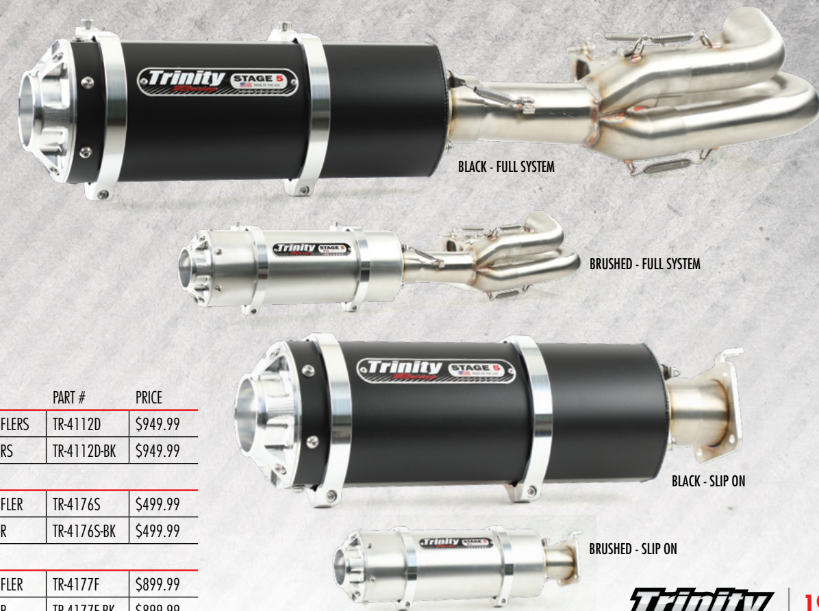
BLACK - FULL SYSTEM