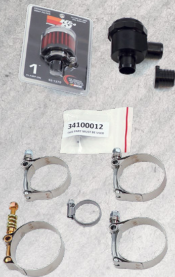
CAN-AM MAVERICK X3