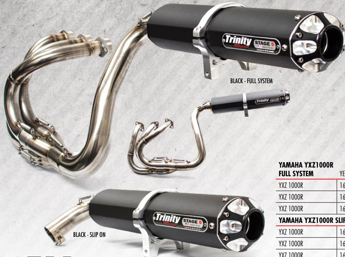
BLACK - FULL SYSTEM