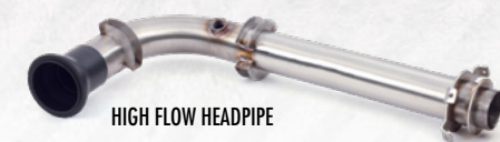
HIGH FLOW HEADPIPE