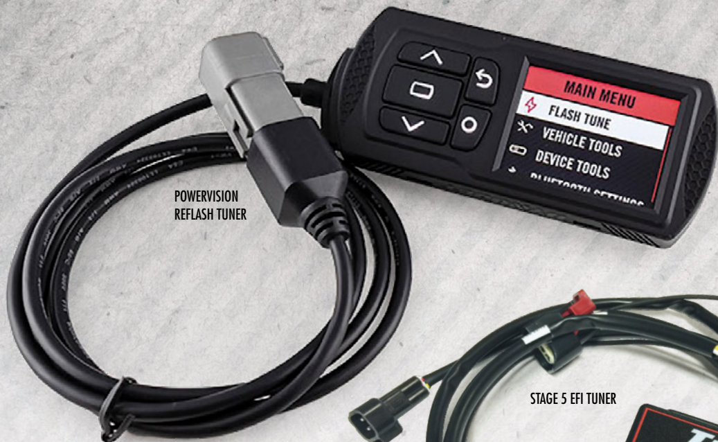
POWERVISION REFLASH TUNER