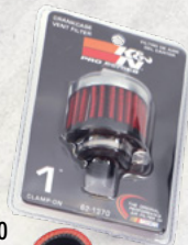
RZR PRO XP/TURBO

Kits are offered complete with a blow off valve, or can be pieced together separately.