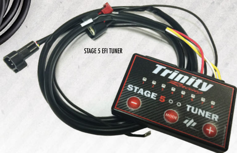
STAGE 5 EFI TUNER

When modifying the exhaust on your side by side, it is imperative that you also have the vehicle tuned properly. Whether you decide to go with the Dynojet Powervision, which includes a fully custom tune specifically built for the Trinity Racing Stage 5 exhaust, or the Stage 5 EFI tuner, you can't go wrong. Both tuners will increase the fuel into the engine, fixing any lean issues that are created from the installation of an aftermarket exhaust. Remember, the more exhaust that is flows out of the engine, the more fuel that is required!