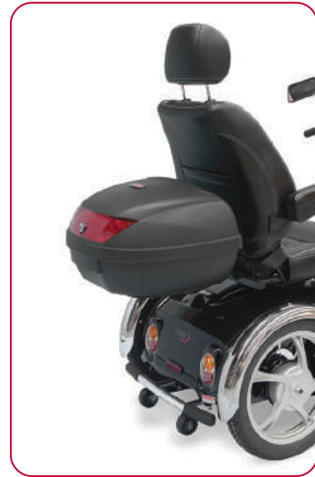
Rear storage pod