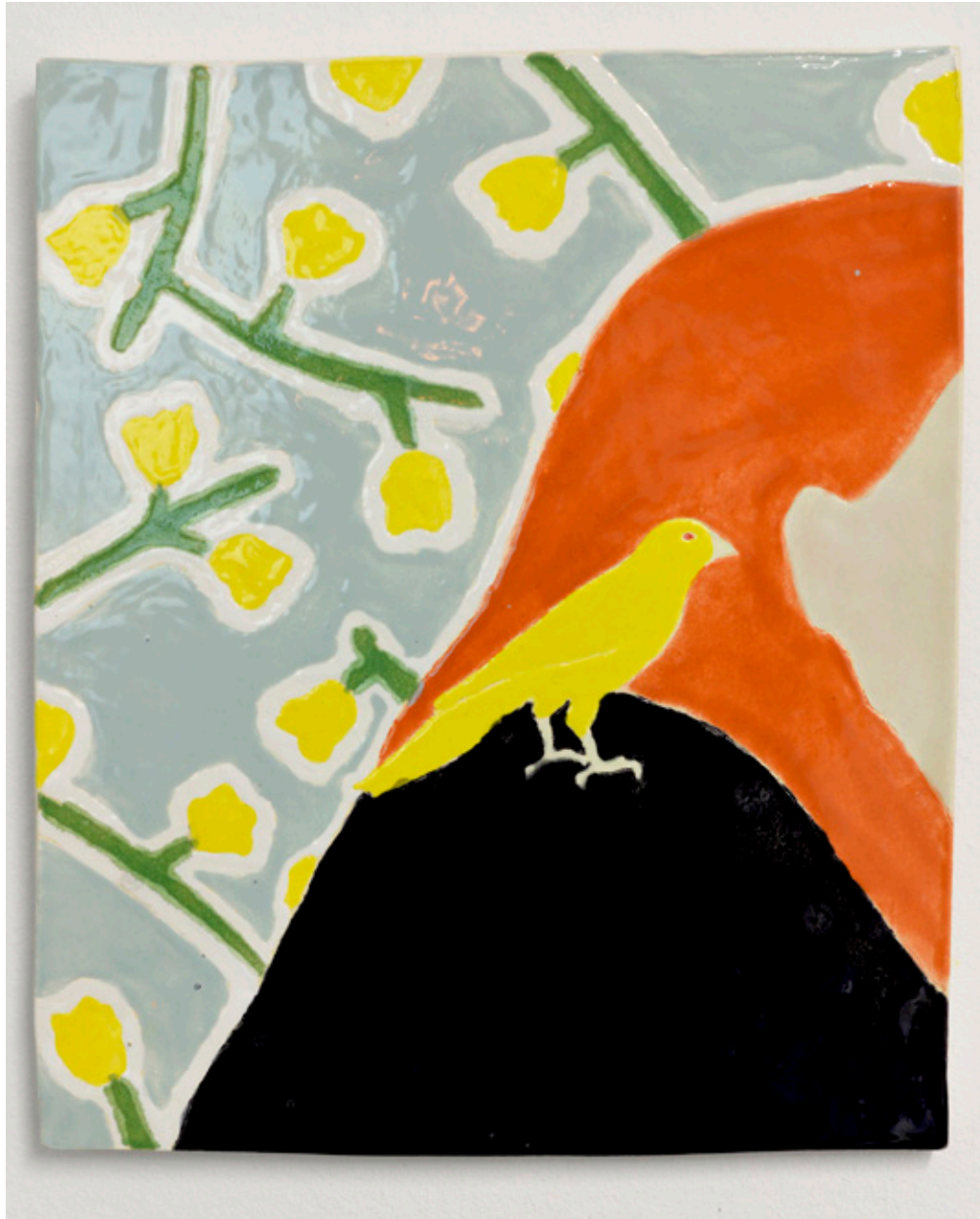
"Bird friend" Glazed ceramic 30 x 20 cms 2023 600 USD