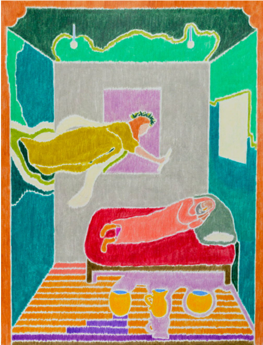
El sueño y las ánforas Colored pencils on paper 40 x 30 cms 600 USD