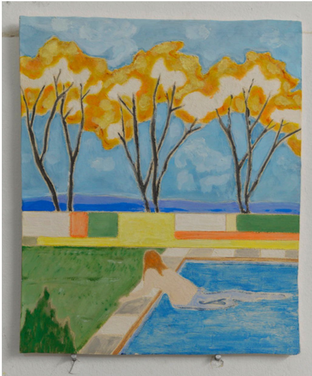
“The pool” Ceramic and oil 30 x 20 cms 2023 600 USD