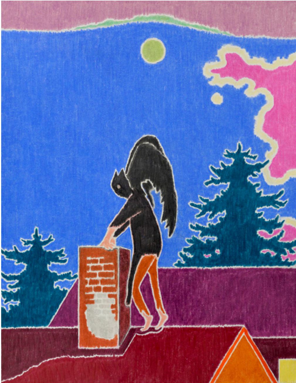
Man climbs into house dressed as bat