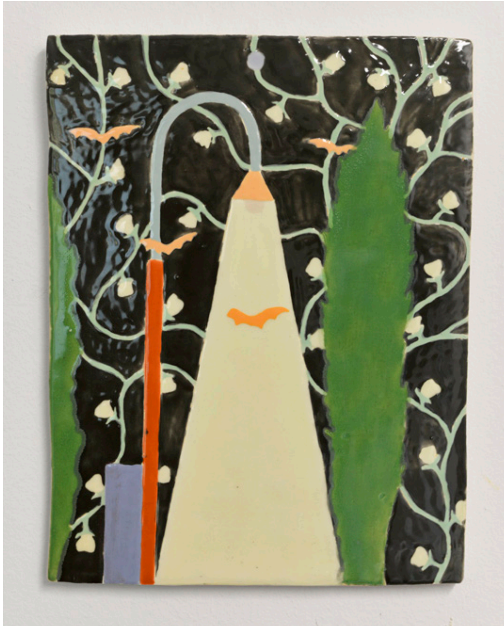
“Street lamp” Glazed ceramic 30 x 20 cms 2023 600 USD