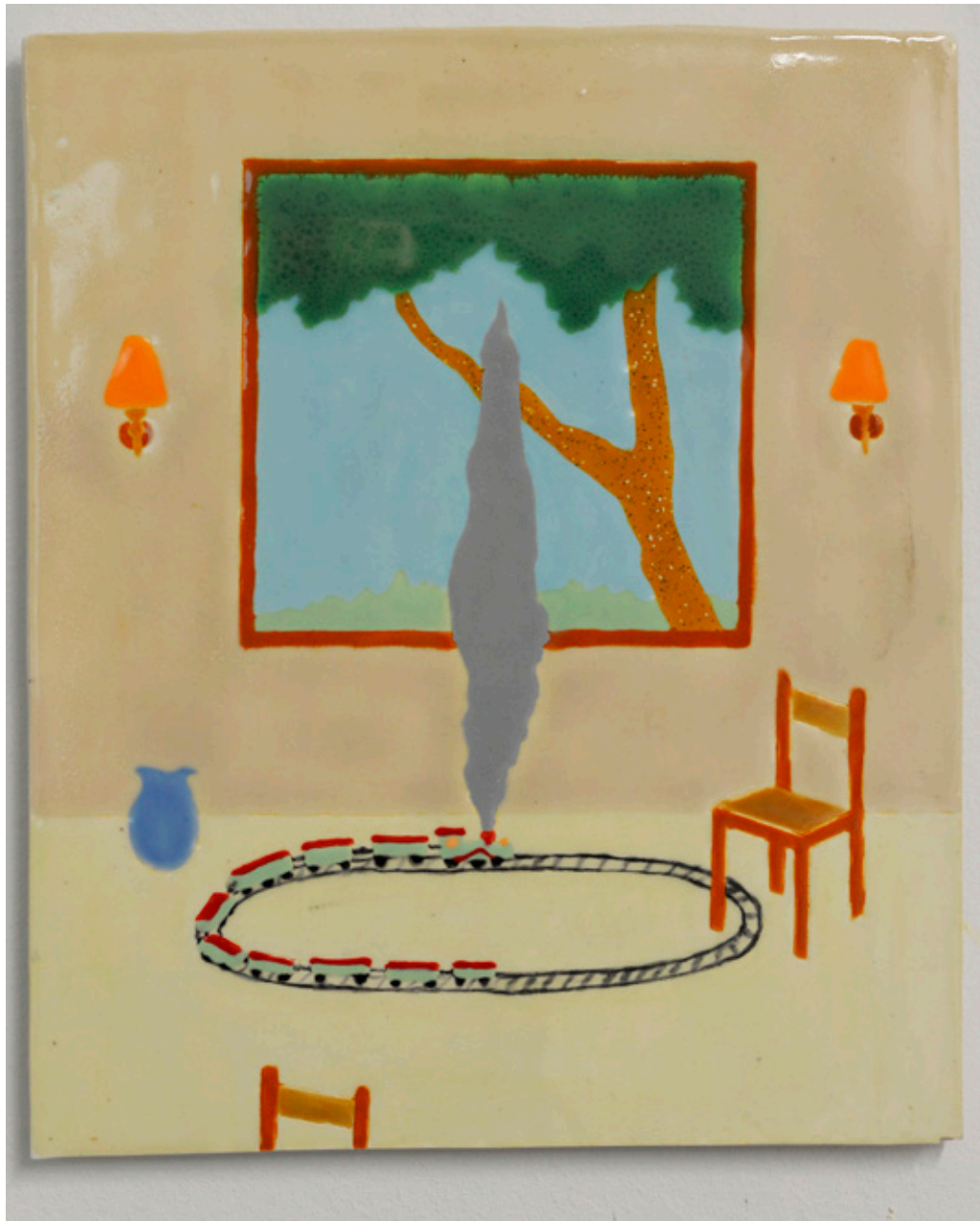
"Toy trains" Glazed ceramic 30 x 20 cms 2023 600 USD