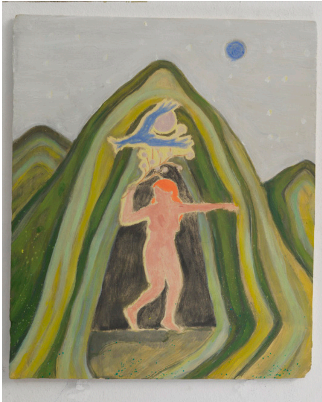
“Untitled (woman and bird)”