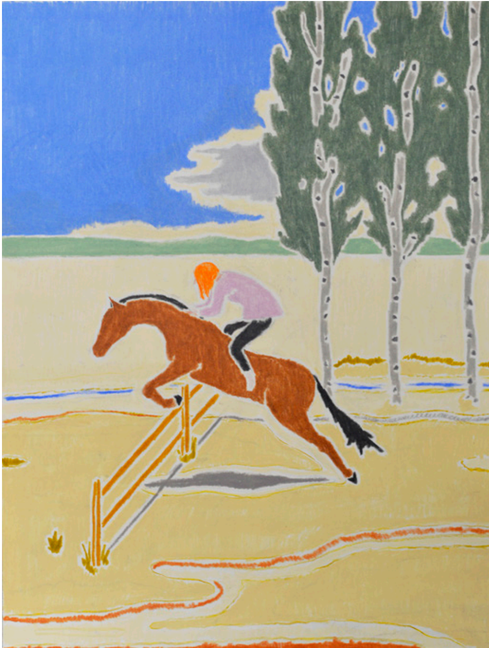
The wind and I are one Colored pencils on paper 40 x 30 cms 600 USD