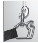
Strap in "No-Pull" Solution Position