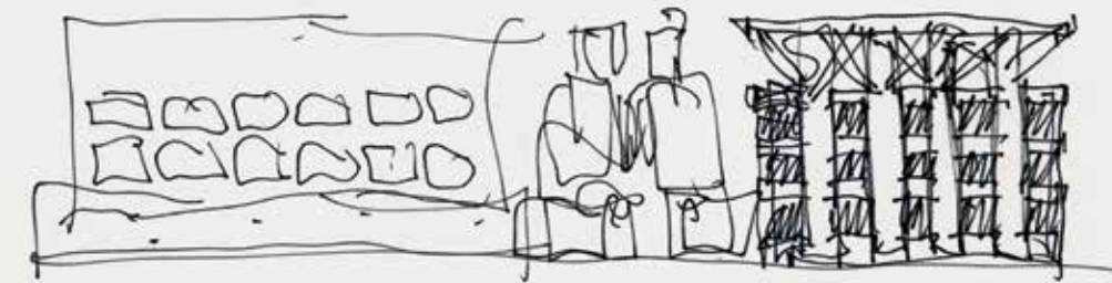
Frank Gehry's sketch of former Chiat Day office, current Google Binocular Building and home of the Venice Art Walk & Auction