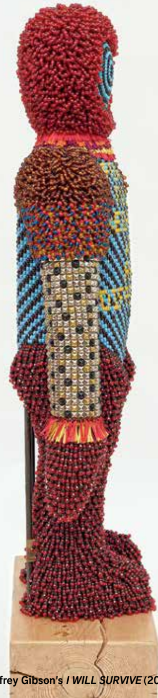
Jeffrey Gibson's I WILL SURVIVE (2020)

The Smithsonian's traveling exhibition " Men of Change: Power. Triumph. Truth. " comes to the California African American Museum. Highlighting and celebrating revolutionary African American men, ranging from Muhammad Ali to Kendrick Lamar to Ta-Nehisi Coates, 25 contemporary artists utilize their own creative vision to share an authentic narrative of African American experiences and history within the context of rich community traditions. CAAMUSEUM.ORG