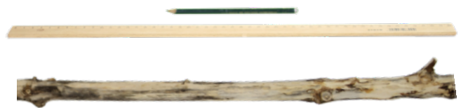
à 10cm, Ø 4cm