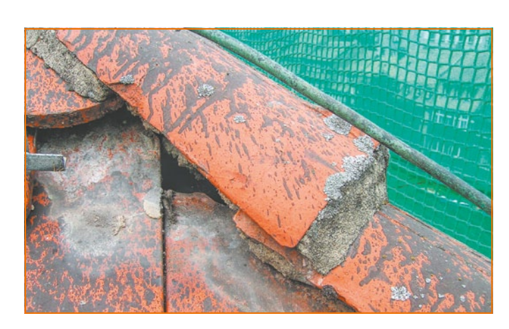
2 Ensure that the substrate is clean and dry.