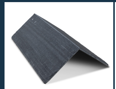
RIDGE/HIP TILE RIE