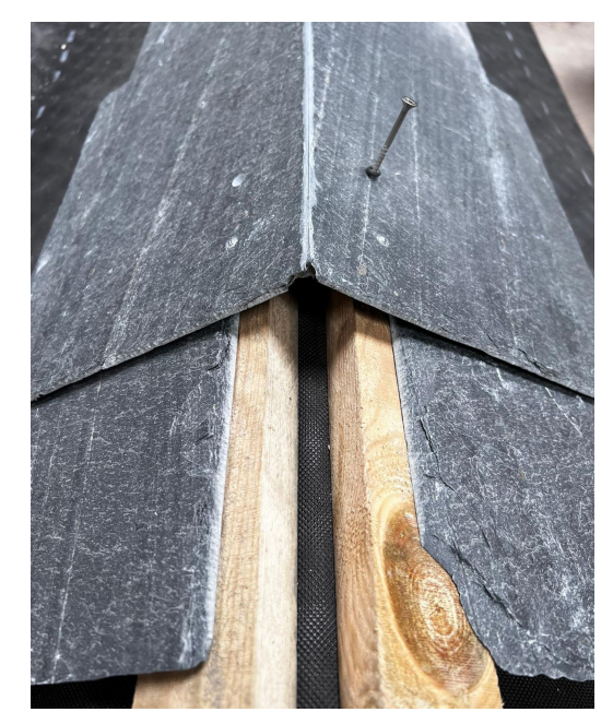
Installation with standard top battens

RealRidge can be installed onto either a ridge runner batten or standard top batten.