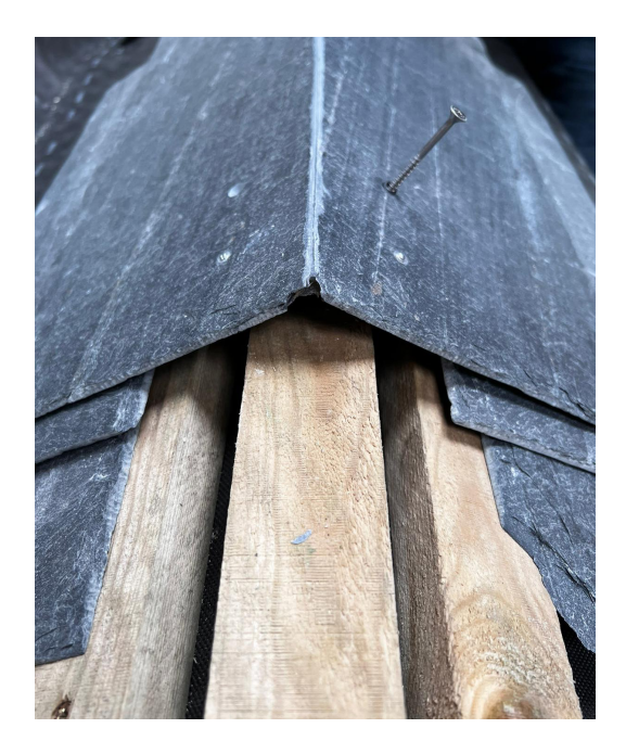
Installation with Ridge runner batten

Final top battens should be no more than 10mm down from the apex. Ridge runner battens should at all points be below the overall height of the slates to avoid the ridge being raised by the batten.