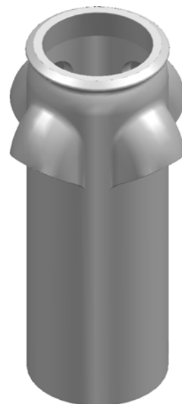
ISOMETRIC VIEW 1:10

OPEN-TOPPED FLUE TERMINAL TO BS EN 13502 - TYPE 0