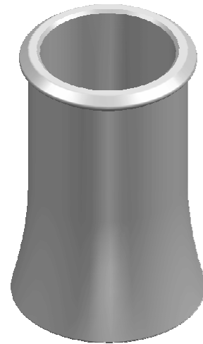
ISOMETRIC VIEW 1:10

OPEN-TOPPED FLUE TERMINAL TO BS EN 13502 - TYPE 0