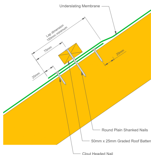
Figure 2: Creating the Overlap - Battened Overlap Detail

When being used unsupported, the roofing membrane should achieve a nominal 10mm drape in between the support positions in order to prevent contact with the underside of the tiles, thus avoiding the transfer of wind loading to the primary roof covering. The drape also serves as drainage for water within the batten space to the eaves position and into the gutter. Fully supported membranes i.e. installed over sarking boards, must incorporate counter battens.