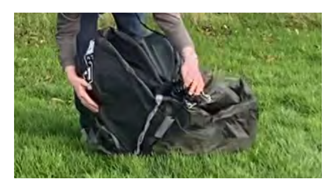
5. Lay the toilet tent onto its side