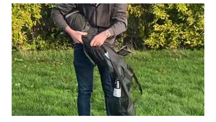
8. Secure the tent with a tie and place into carry bag