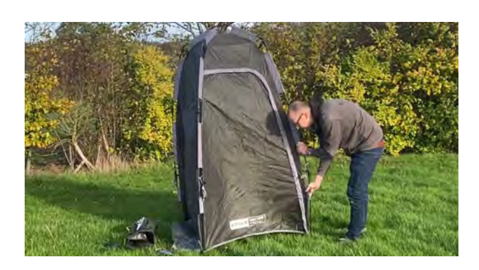
5. Fold out lower leg until joint locks in to place, repeat on 3 remaining legs