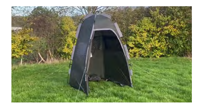
For additional support in windy weather extra guy lines can be tied to the 2nd up joint