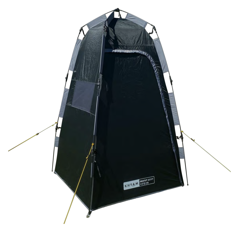
Pitching & Striking Instructions for :-