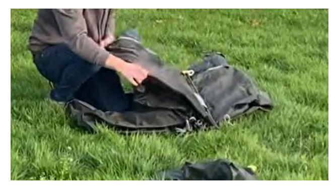
6. Fold each section/panel over towards you (similar to folding an umbrella)