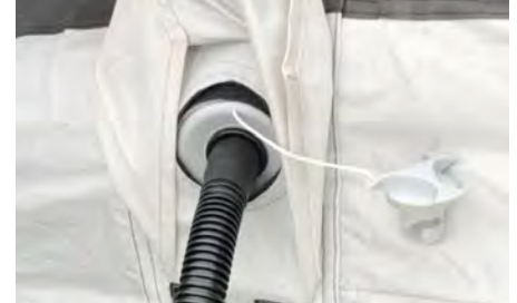
*Fig 1. - Valve position is changed with the white push button at the centre, there are two positions. Closed/Inflate - button will be taller/protruding of housing | Open/Deflate - button will be depressed/shorter Pump Hose is a bayonet style connection and locks in place with a twist