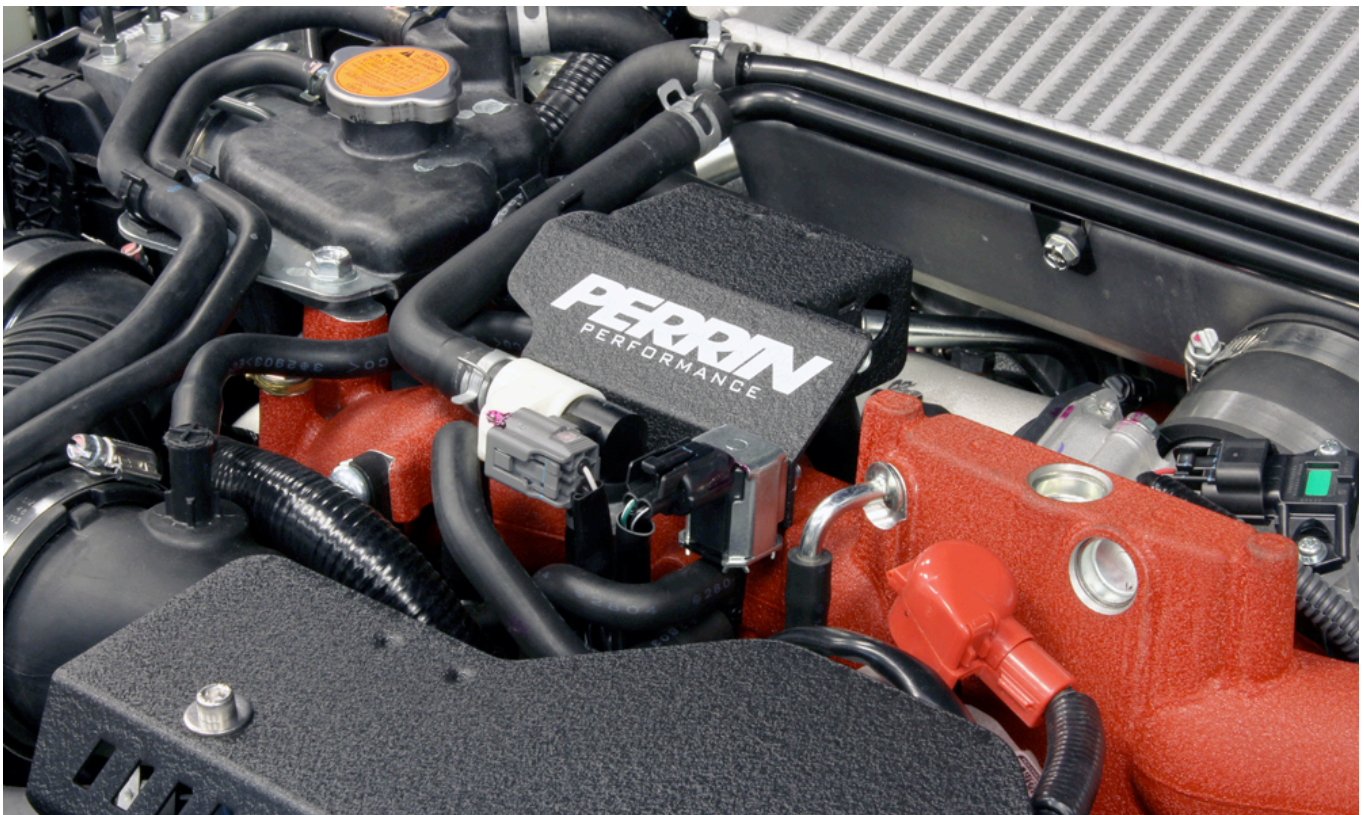
Installation shown with PERRIN EBCS Pro installed in place of OEM boost solenoid.